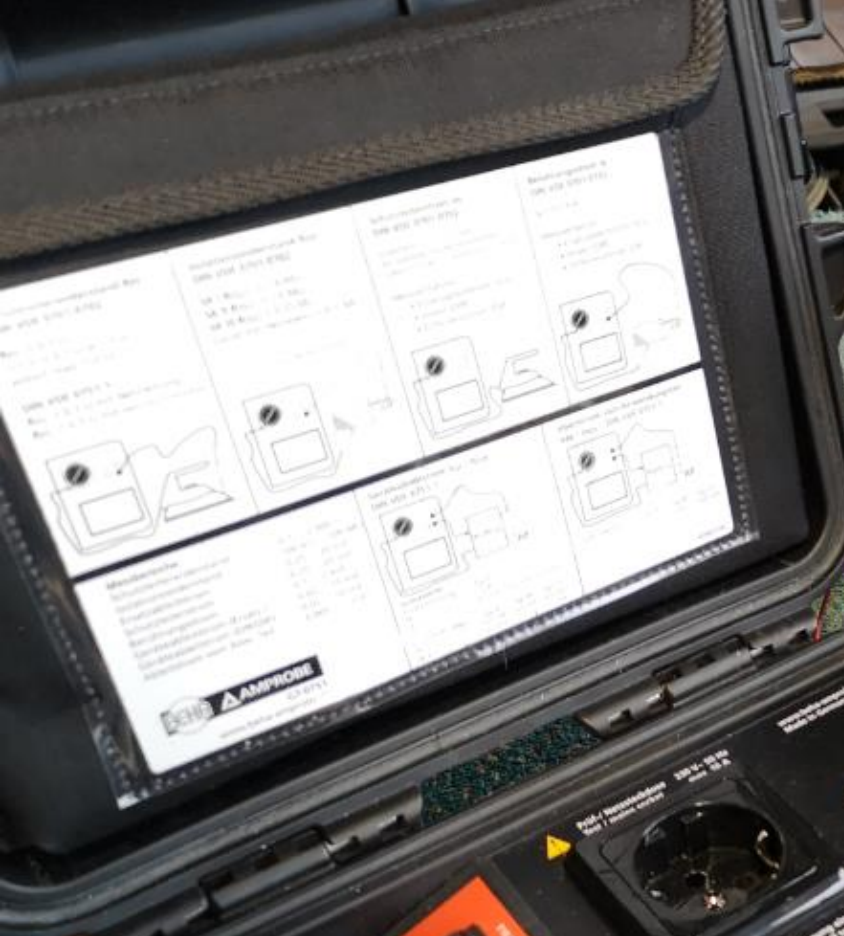
QS - CONTROL